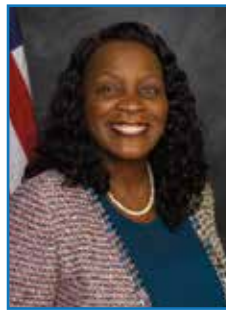
MAYOR ACQUANETTA WARREN