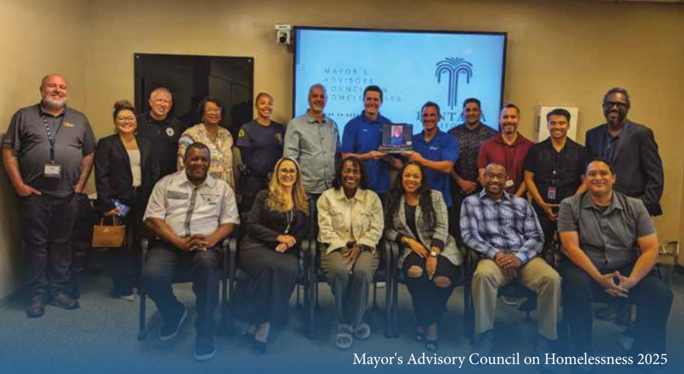
Mayor's Advisory Council on Homelessness 2025